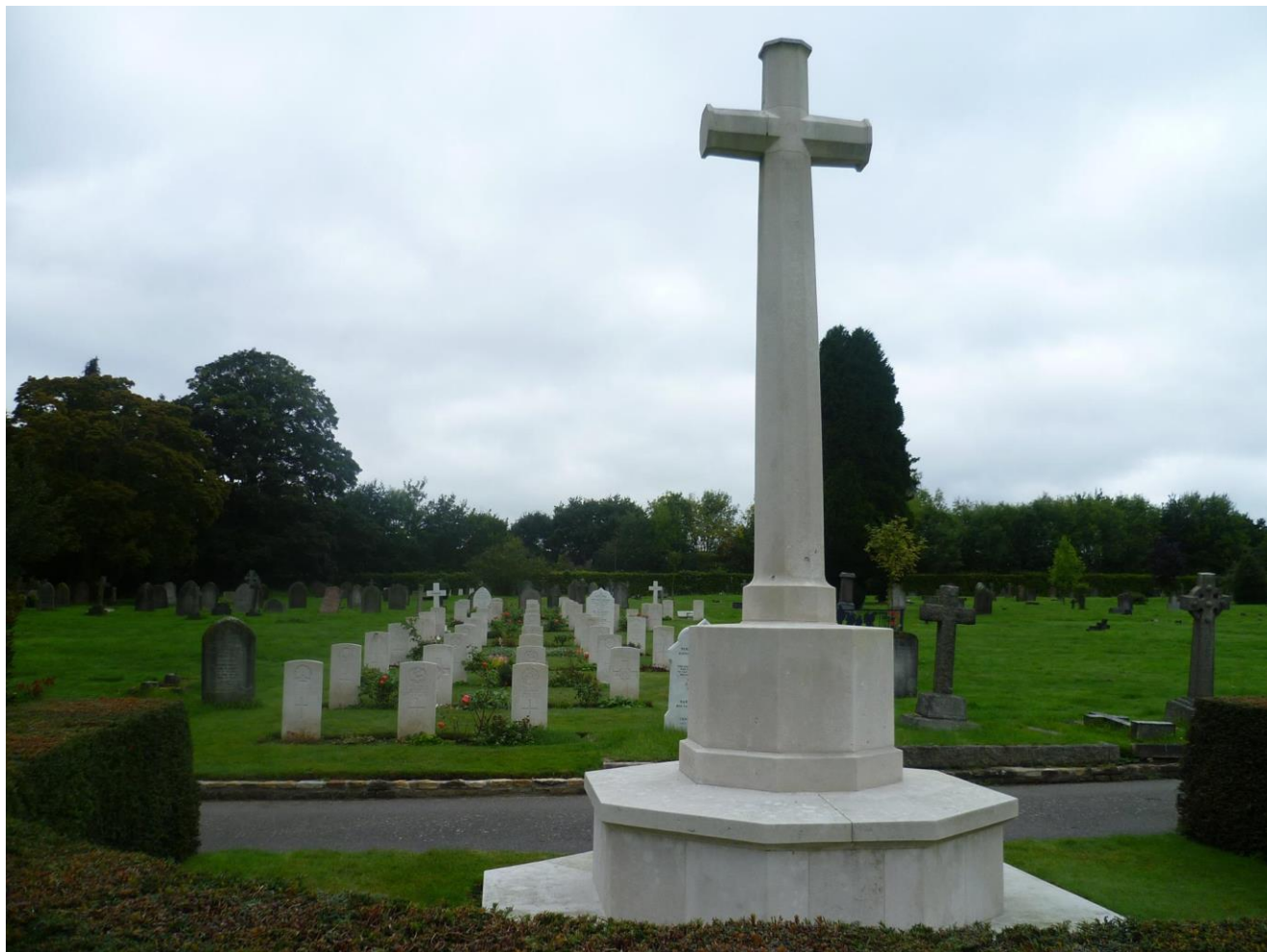
Cross of Sacrifice in Stoke Old Cemetery, Guildford

There are 4 Australians buried in this Cemetery.